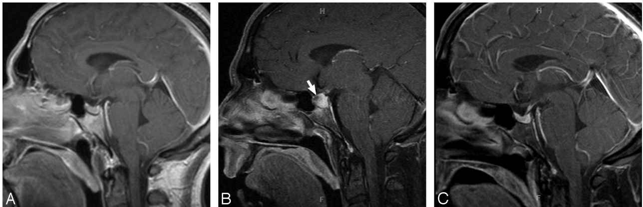
Fig 2. A , Postcontrast T1-weighted MR image of the brain at initial metastatic work-up demonstrates a normal pituitary gland and stalk. B , Postcontrast T1-weighted MR image of the brain after several doses of ipilimumab reveals diffuse enlargement of the pituitary gland and superior displacement of the infundibulum. Note the area of heterogeneous enhancement (arrow). C , Postcontrast T1-weighted MR image after discontinuation of ipilimumab and initiation of steroid replacement shows that the pituitary gland has returned to baseline.